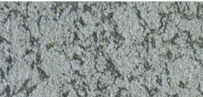
Sandy Landau Grey