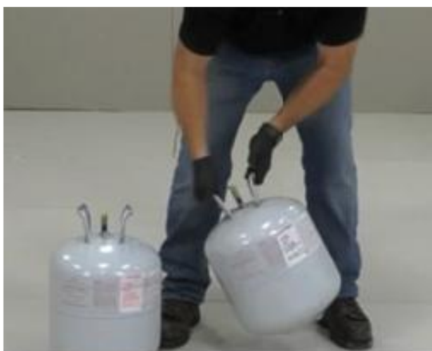
Shaking of A-side and B-side tanks