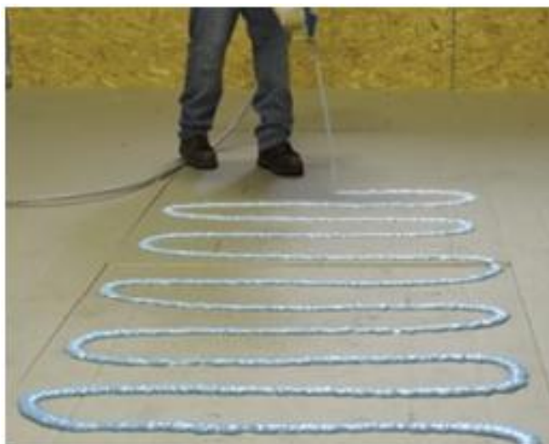
Apply using extension nozzle