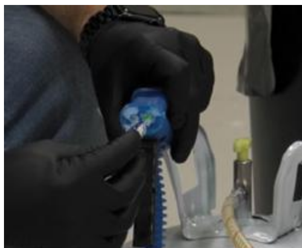
Application of petroleum jelly to spray gun