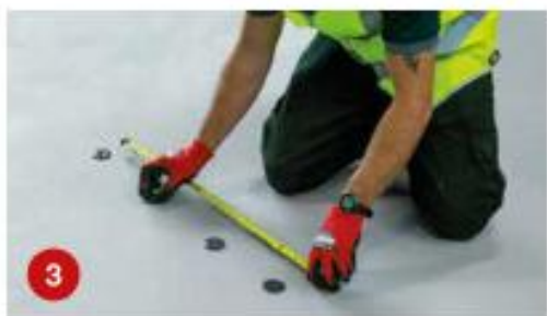
3. Apply fasteners for the application at centres determined by a Wind-Load Calculation.