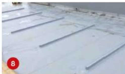
8. How the completed system will look.