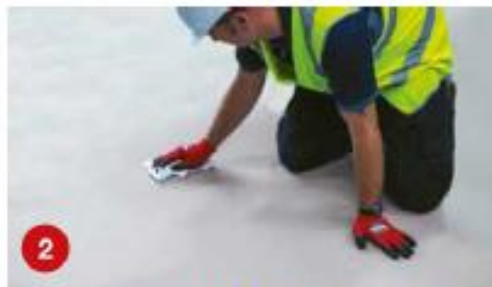
2. Clean surface with Viking Weathered Membrane Cleaner (STP001).