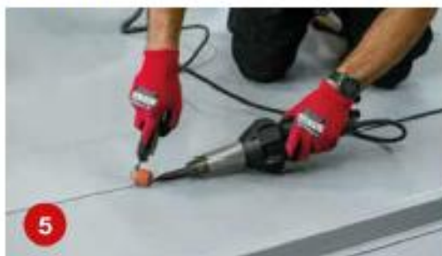
5. Hot-weld the 180mm wide membrane cover-strap to seal over the fixing line, taking pressure off the existing membrane.