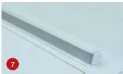
7. How a single EJOBAR TPO 2G looks in position.