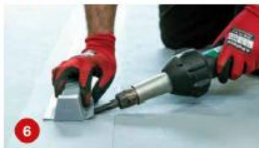
6. Hot-weld EJOBAR TPO 2G in the centre of the membrane, directly over the line of fasteners.