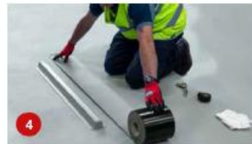
4. Prepare 180mm wide 1.52mm Enviroclad cover-strap rounding the ends, 100mm longer than the bar.