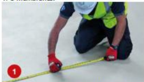
1. Accurately measure and mark out the EJOBAR TPO 2G installation area.

The sequence below provides a good practice guide when welding the EJOBAR TPO 2G system to Enviroclad TPO membranes.