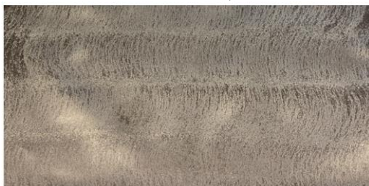
Proper Coverage on Membrane