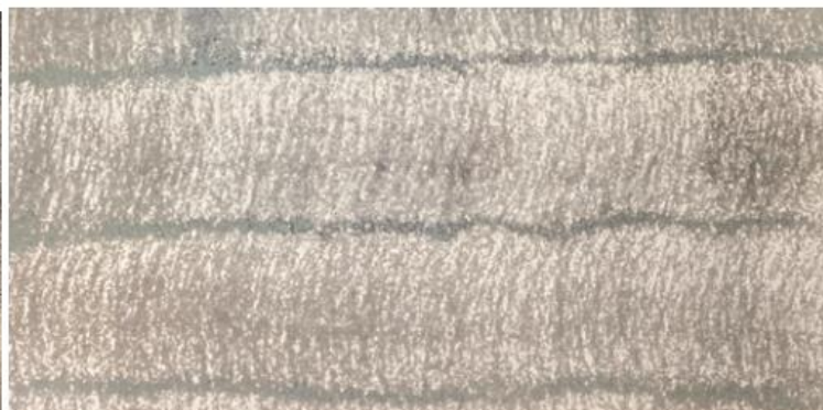
Proper Coverage on Insulation